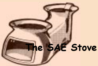
The SAE Stove

Throughout the year, the secretariat is also trying its best to reply promptly and appropriately to requests for publications, information and other resources. We welcome more such requests and feedback on our performance thus far.